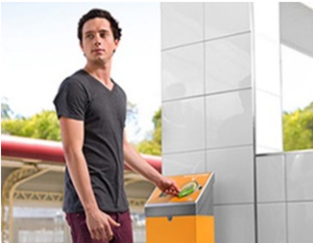
Go Card reader at a train station