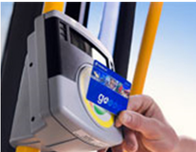
Go Card reader on a bus