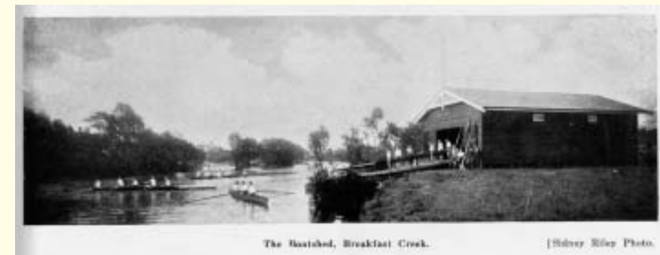
The Boatshed, Breakfast Creek.